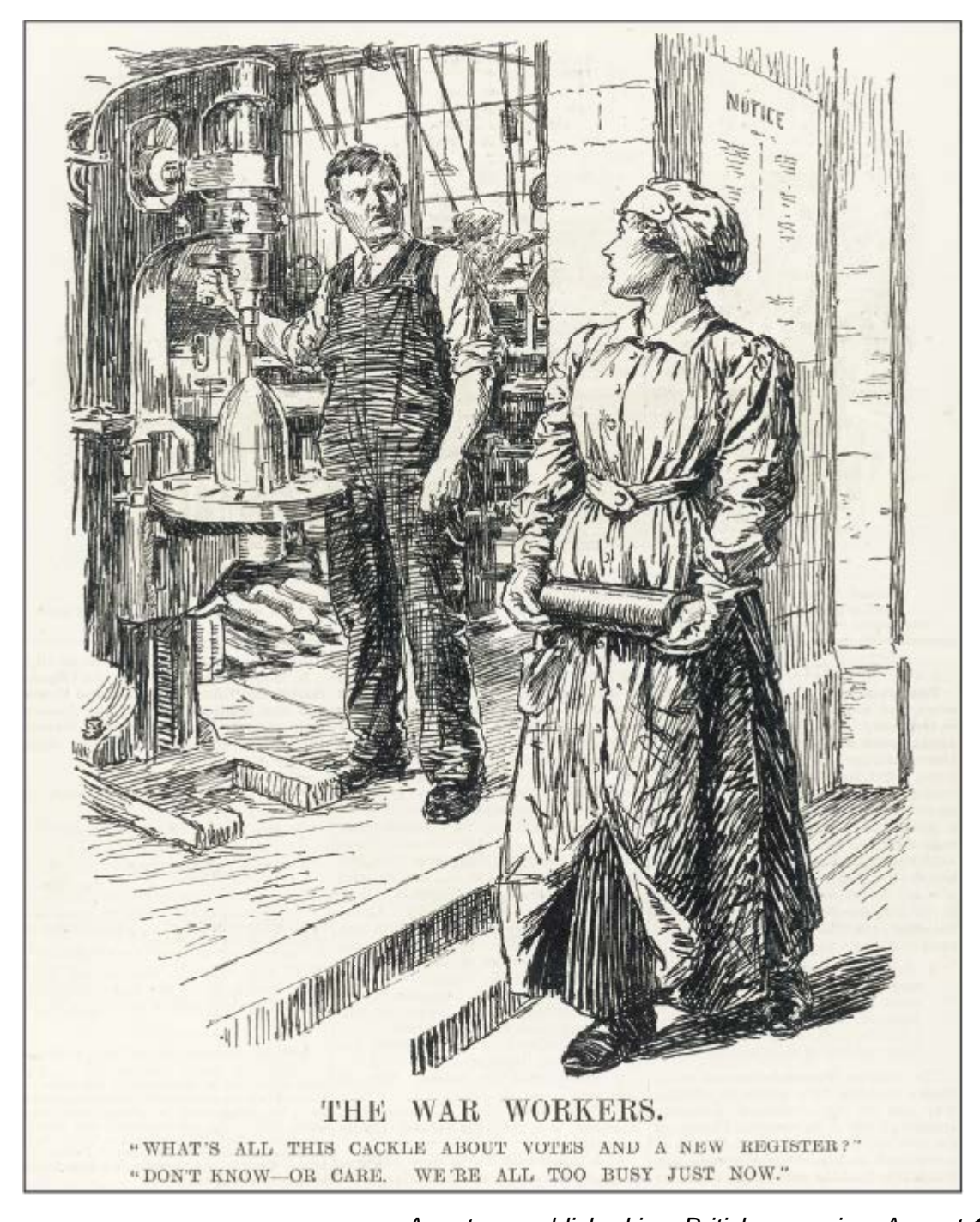
A cartoon published in a British magazine, August 1916.

Cackle = silly chatter Register = list of voters